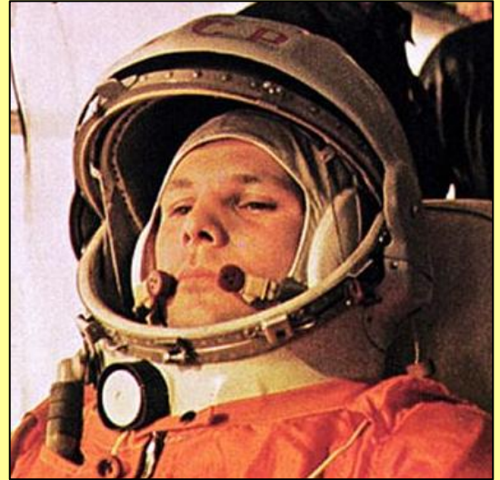
Cosmonaut Yuri Gagarin, the first human in space and to orbit the Earth.

The ARISSat-1 that will operate in his honor will do so with a CW beacon and on FM phone using the call sign RS01S. There will be both SSTV video (transmitted as FM audio) in Robot-36 format and 24 different voice greetings, mostly of children, but with a special one from Yuri Gagarin. These will be broadcast in 15 different languages. Article continued on next page ►