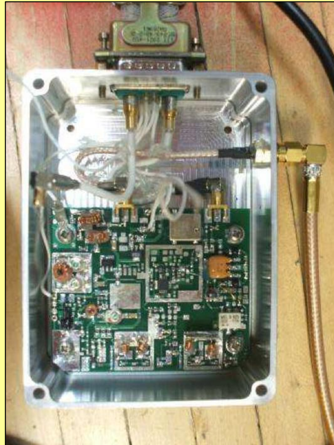
The transceiver unit in the ARISS-1 amateur satellite is about the size of a Starbucks® Venti cup.

Information and photographs courtesy of AMSAT, the Radio Amateur Satellite Corporation.