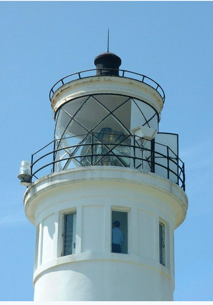
The Pt. Vicente Lighthouse will be open for PVARC members and their families during Lighthouse Weekend.

Mark your calendars for this once-a-year event. The weather might be blazing hot in the L.A. basin that day, but it's always pleasant at Pt. Vicente.