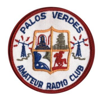
03 JAN 2011