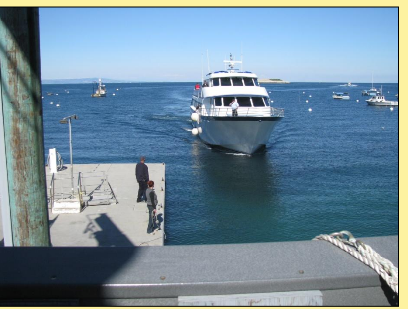
The Catalina Express approaches Two Harbors' dock, with the Palos Verdes Peninsula shown in left background. This year we'll be bringing over 800 pounds of radio gear, tools, food, and personal stuff on-board.