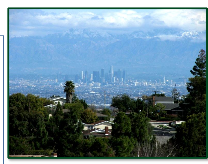
View looking northeast from Al6DF's QTH, which has antenna restrictions beyond the city's code.