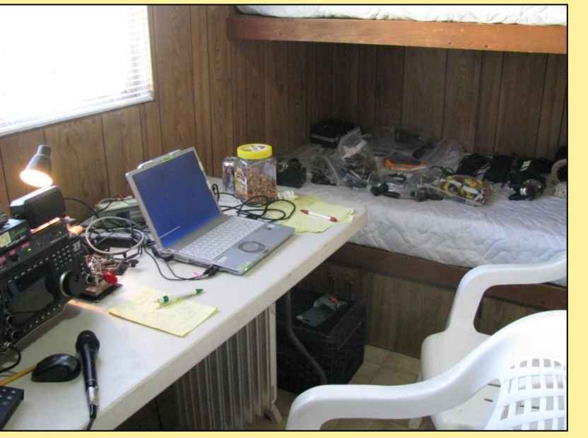
No room or time for sleeping in this cabin ham shack during last year's DXpedition. The beds served as storage space for more radio gear.