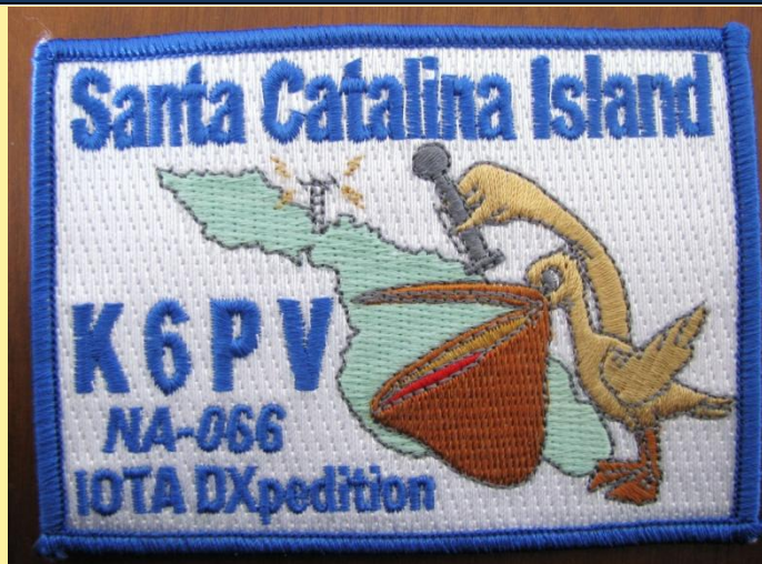
Jacket patch for IOTA DXpedition participants.