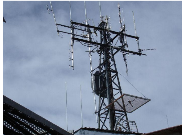
The Snow Peak ATV repeater antenna.

When: 7:30 pm, Wednesday, January 18, 2012