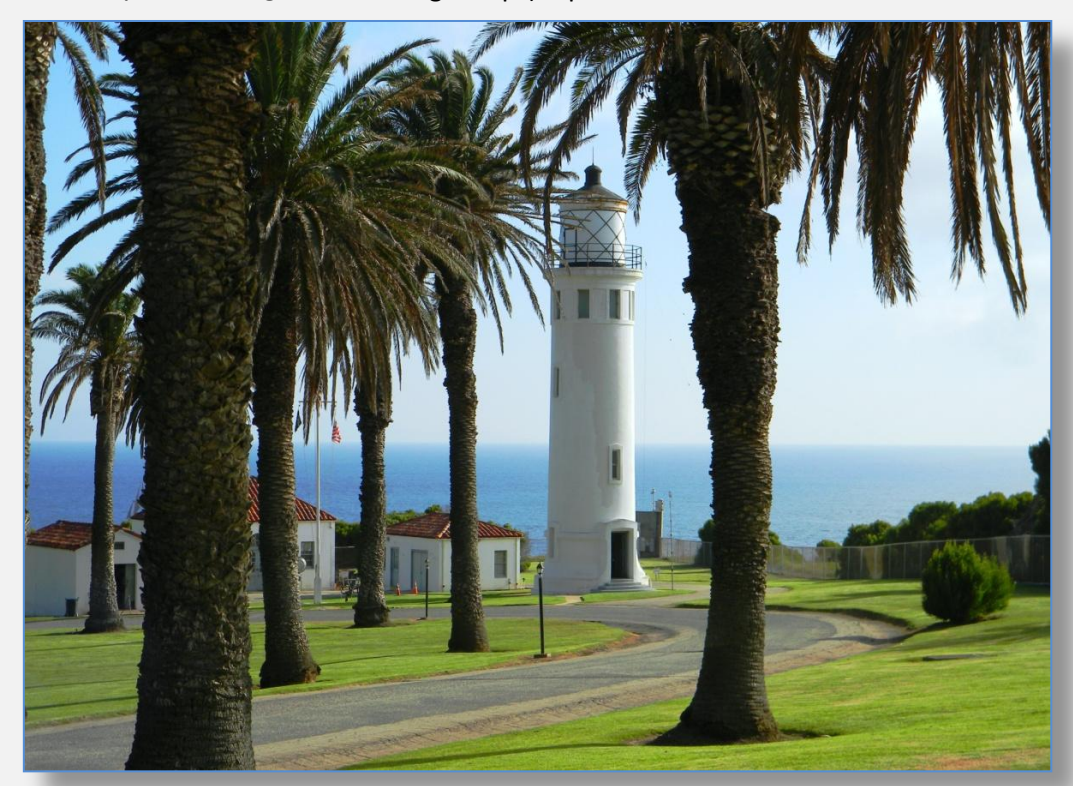
Right: The Pt. Vicente Lighthouse is shown backlit at 5:25 pm on Saturday, August 20, 2011, during last year's International Lighthouse & Lightship Weekend as Clay, AB9A, operated from inside.

Last year's ILLW had 470 lighthouses (including 19 lightships) represented in 55 countries. ■