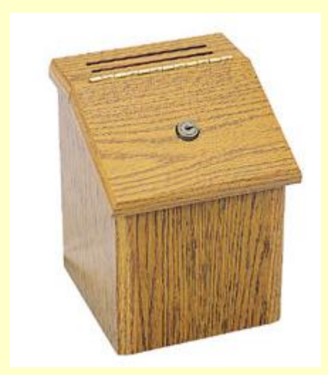
The Traditional Suggestion Box

http://www.edn.com/design/communicationsnetworking/4372294/High-performance-HFtransceiver-design-A-ham-s-perspective