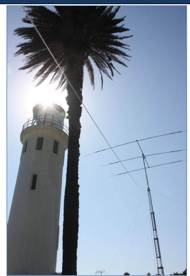
Bright idea: After unexpectedly learning the Pt. Vicente Lighthouse's upper deck was unsafe for attaching our usual wire antenna, Joe NZ6L and Dale N6NNW quickly got the club's tower trailer mated with Dale's Field Day Yagi.

Morse Code is still alive and on the cutting edge of space exploration. NASA as put hole patterns in every wheel, on their new Mars Curiosity Rover, that spell out JPL in Morse Code. The purpose of the pattern is to create features in the terrain that can be used to visually measure the precise distance