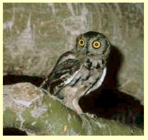
No QSO with his relatives at Pt. Vicente this year: A Western Screech Owl.

But we made a 5x9 20-meter QSO with a New Zealand amateur and ended in a long-winded contact with a really Southern ham in Dothan, AL