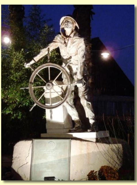
When you see this helmsman you are just outside the restaurant's entrance.

Our dinner location is the 2<sup>nd</sup>-floor Breakwater Room, located at top of the stairs just inside the restaurant entrance. There is also an adjacent elevator to reach the 2<sup>nd</sup> floor.