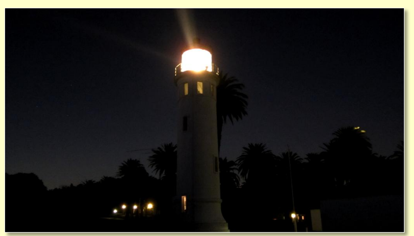
Pt. Vicente Lighthouse during the 2013 ILLW: If you operate there at night they'll leave the light on for you.

Contact Diana, AI6DF, at <u>ai6df@arrl.net</u> or Clay, AB9A, at <u>ab9a@arrl.net</u> if you can assist—and regardless, we'll see you at the Lighthouse.