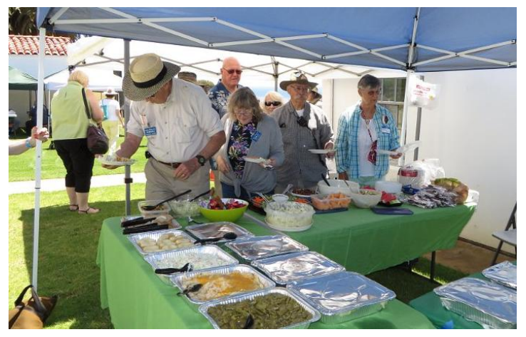
Above : This year we had a major change: food catered by Dickey's Barbeque was delivered instead of on-site grilling.