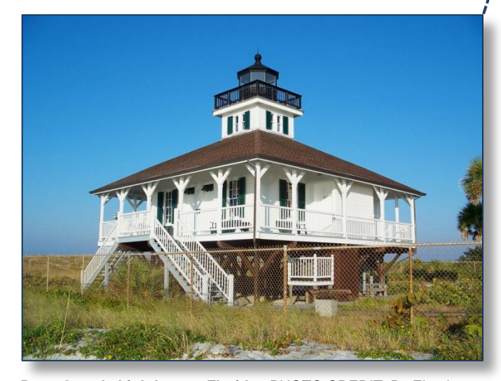
Boca Grande Lighthouse, Florida.