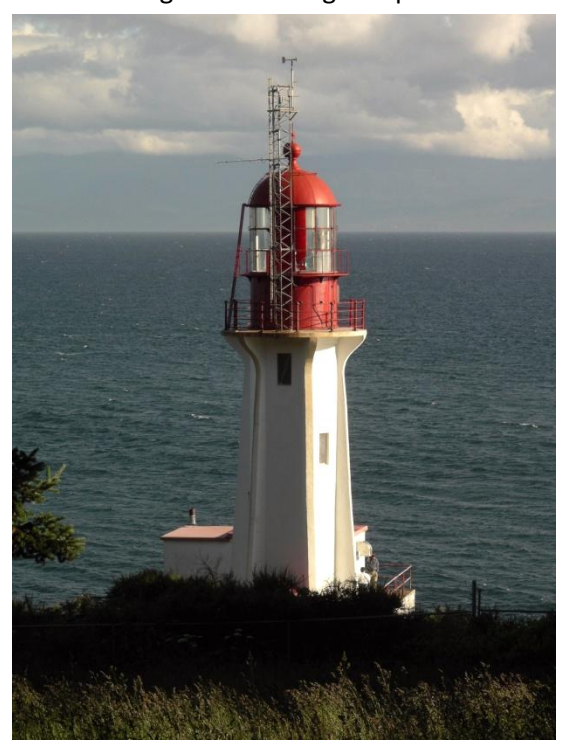
Sherringham Point Light, British Columbia, Canada: A local preservation group has applied for "Heritage" status and is awaiting the decision.

Time will tell what fate awaits Canadian lighthouses. In the meantime, many lighthouses worldwide are having traditional Fresnel lenses replaced with smaller more-efficient LED airways-style rotating beacons. These lighthouses will continue shining "when all else fails"--much as ham radio does—and we celebrate that too on International Lighthouse & Lightship Weekend.