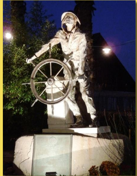
When you see this helmsman you are just outside the restaurant's entrance.

Our dinner location is the 2 nd -floor Breakwater Room, located at top of the stairs just inside the restaurant entrance. There is also an adjacent elevator to reach the 2 nd floor.