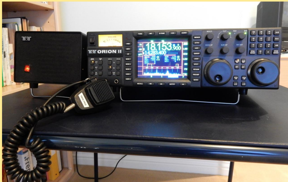
Ten-Tec Orion II being offered for sale by K6JW.