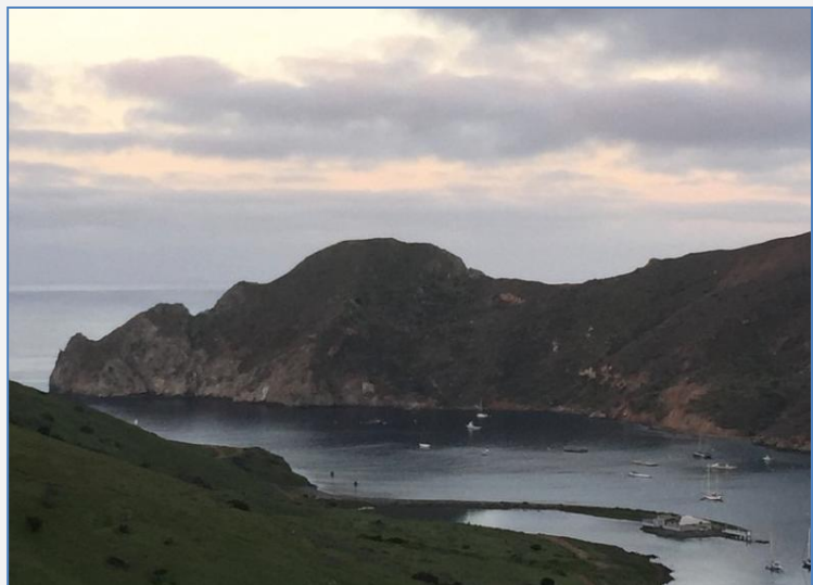
The rugged Catalina Harbor on the island's west side at the Isthmus is about 400 feet from K6PV's operating position at Two Harbors, shown during our 2015 DXpedition.

We expect to have two stations operating simultaneously, with a third radio as back-up. ■