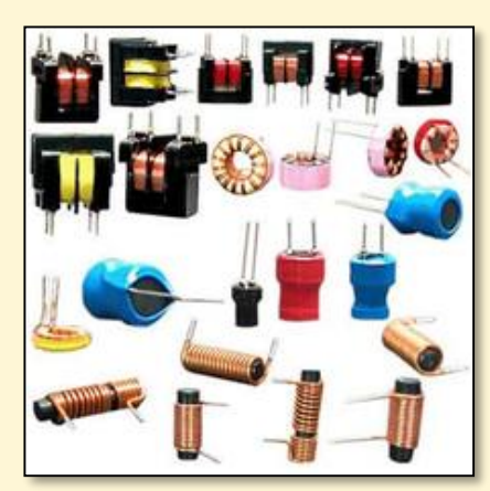
Figure 3: Examples of inductors

Inductance is the property of an electric conductor by which a change in current through it induces a voltage across it (and can also even induce a voltage across a nearby conductor). A steady current flowing through a conductor will produce a steady magnetic field around it; and, with no change in that field, no voltage will be induced. However, a time-varying current will create a time-varying magnetic field which will induce an electromotive force (voltage) across the conductor. The greater the rate of change of the field, the greater will be the induced voltage.[3] As a result of this property, we can say that inductance is the ability of a body to store (and later release) energy from its magnetic field.