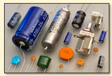
Figure 2: Examples of capacitors

Capacitance is the ability of a body to store (and later release) energy in the form of electric charge. It is measured in farads (F) and symbolized mathematically by "C". Capacitance is a function of the geometric design of the body configured to store charge. The physical device that we normally associate with capacitance is called a capacitor. The simplest capacitor uses conductive plates separated by a dielectric material. The numerical value of capacitance is a function of the area of the plates, the distance between them and the nature of the dielectric material (called the permittivity) between the plates.[2] The bigger the area and the closer the plates are together, the greater the capacitance. [Note that physical capacitors not only have capacitance, but they also have a little resistance and inductance.].