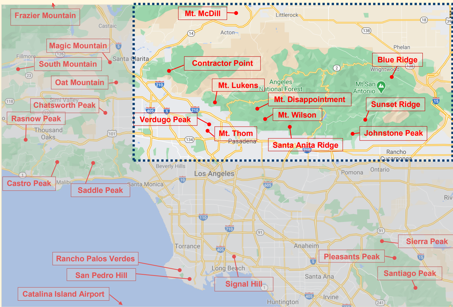
Below: Highlighted at top right are the prime San Gabriel Mountains repeater sites amateur radio uses.