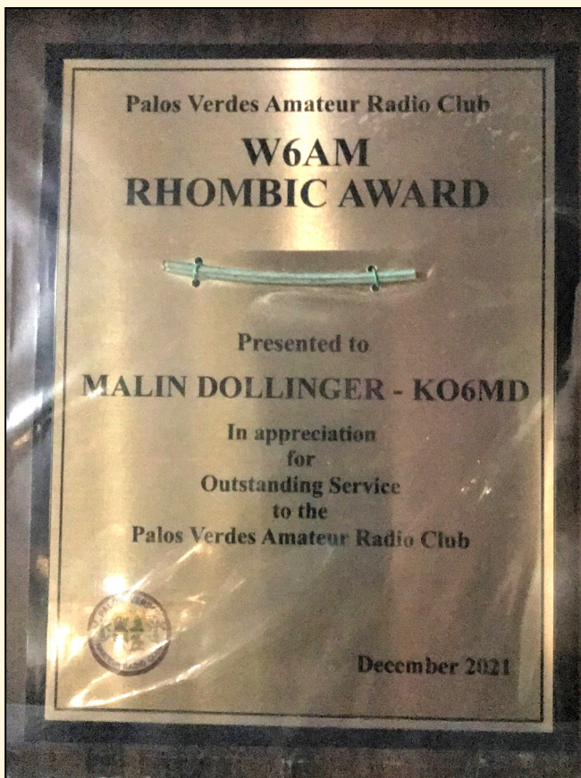
Left: The PVARC’s Rhombic Award for outstanding club service features a snippet of copper wire from the massive rhombic antenna formerly at the Rancho Palos Verdes station of legendary DXer Don Wallace, W6AM (SK). Until his death in 1985 Don’s rhombic antenna reached all corners of the globe from what is now the Wallace Ranch group of luxury homes at Highridge Road and Crestridge Drive.

(Note: This photo shows the 2021 Rhombic Award inside protective plastic wrapping.)